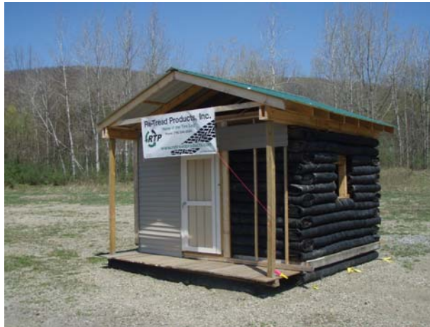
This small "log cabin" was built using Re-Tread's tire logs.